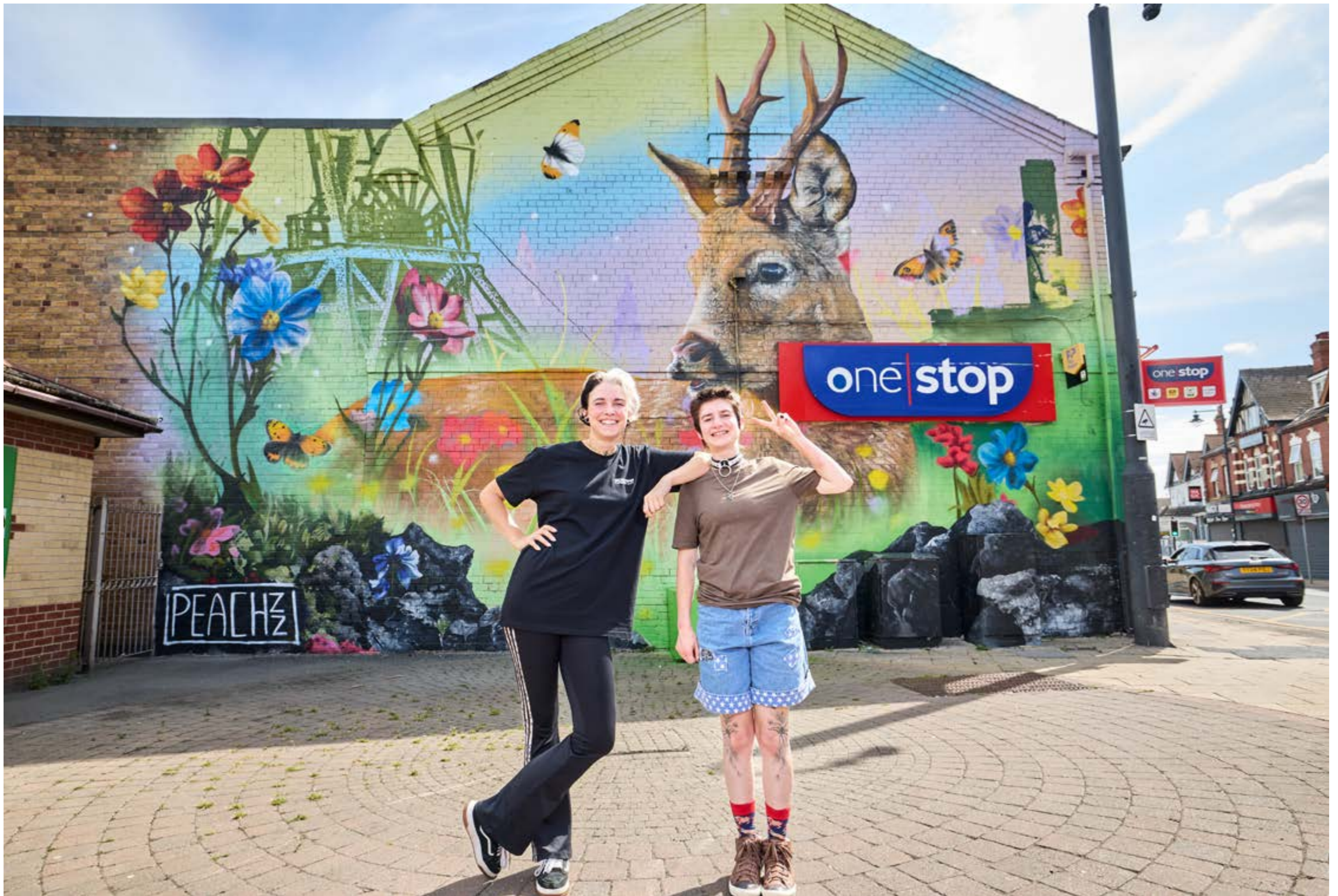
Image: Ashfall and Bloom by Peachzz supported by Creative Associate, Makena Brooks © Wakefield Council.