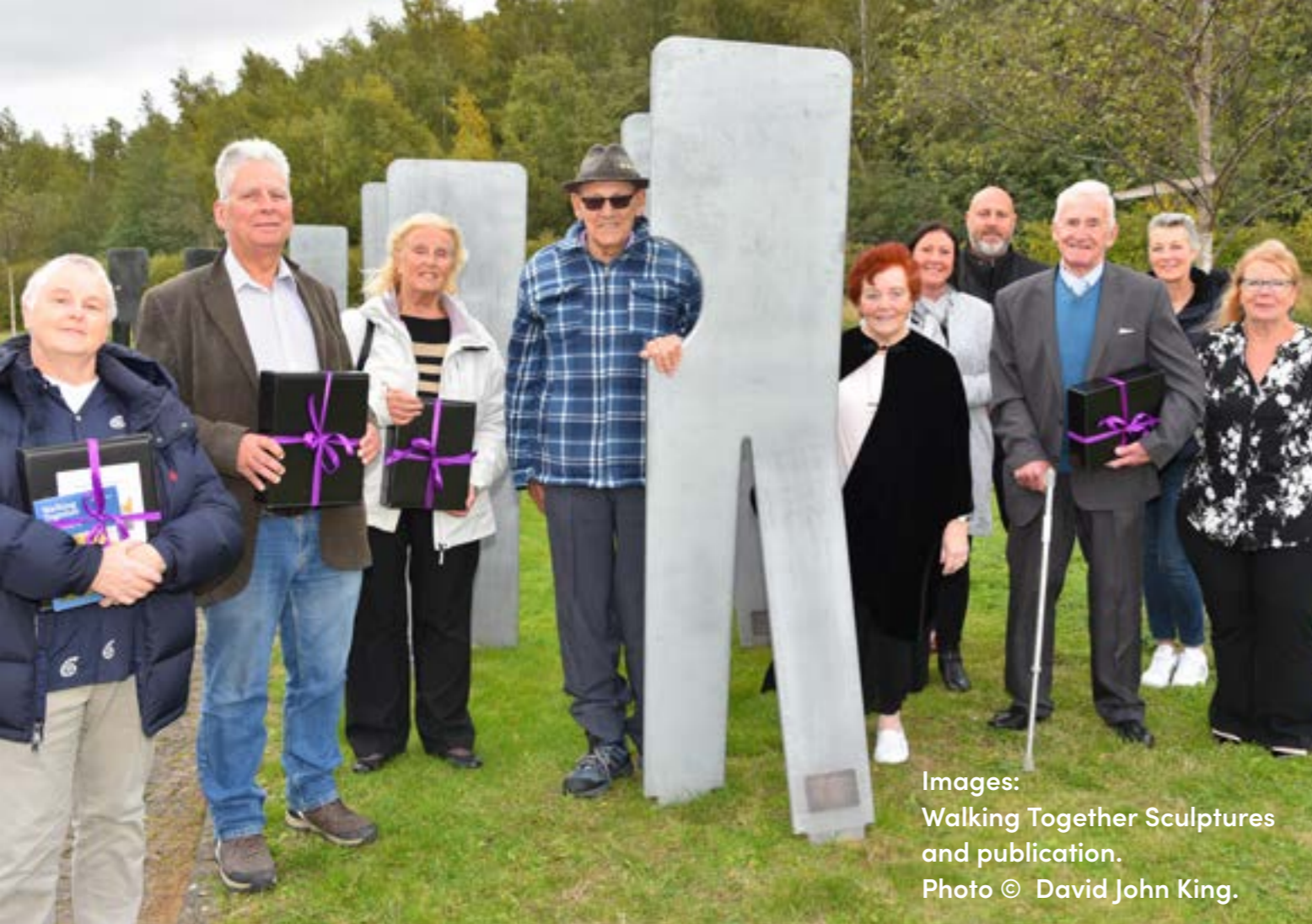
Images: Walking Together Sculptures and publication.