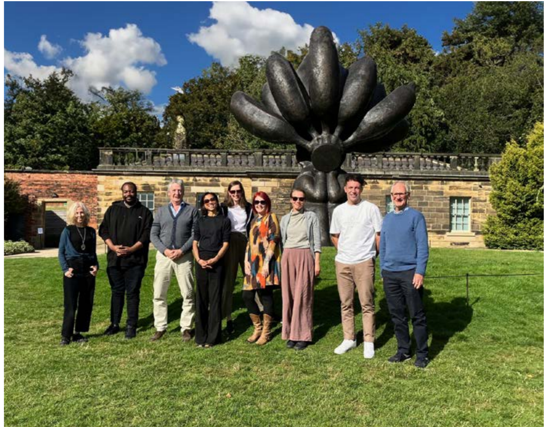
Image: Board Away Day at the Yorkshire Sculpture Park

We are proud group members of the Academy of Urbanism, Wakefield Civic Society, and sit on the Wakefield District Public Art Framework Steering Group.