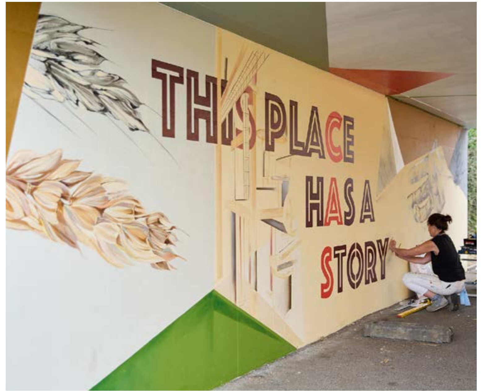
Images: This Place Has a Story to Tell by Emmeline North © Nicholas Singleton