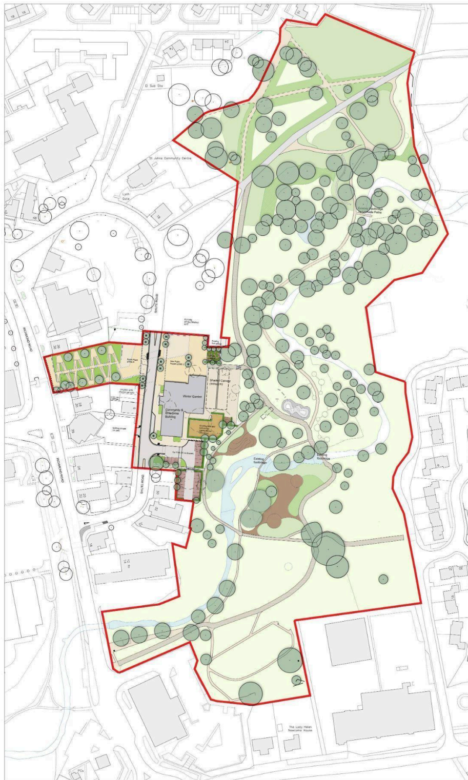
Proposed Site Plan - Coloured : Scale 1:750

The area of the site is indicated by the red line boundary on the below plan.